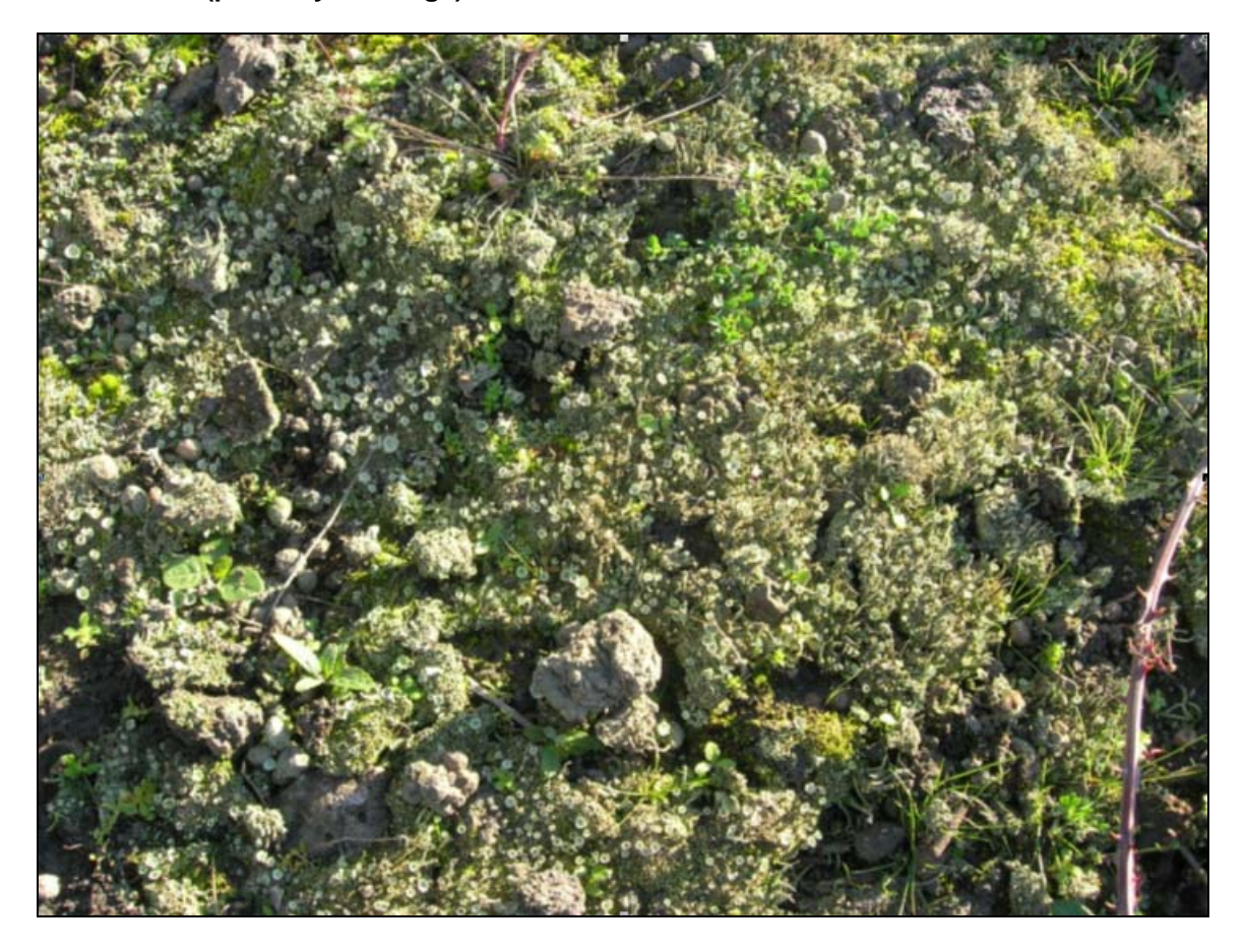
Figure 5. Lichen heath growing on 20 millimeters of pulverized fuel ash on a derelict site in east London.