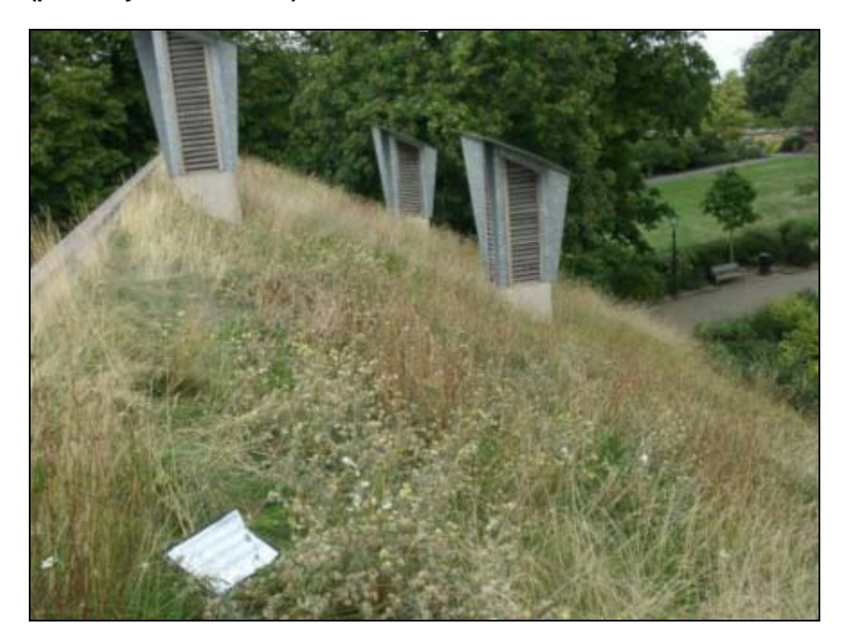
Figure 2: The north-facing section of the roof on the CUE Building, Horniman Museum (photo by B. Nicholson).