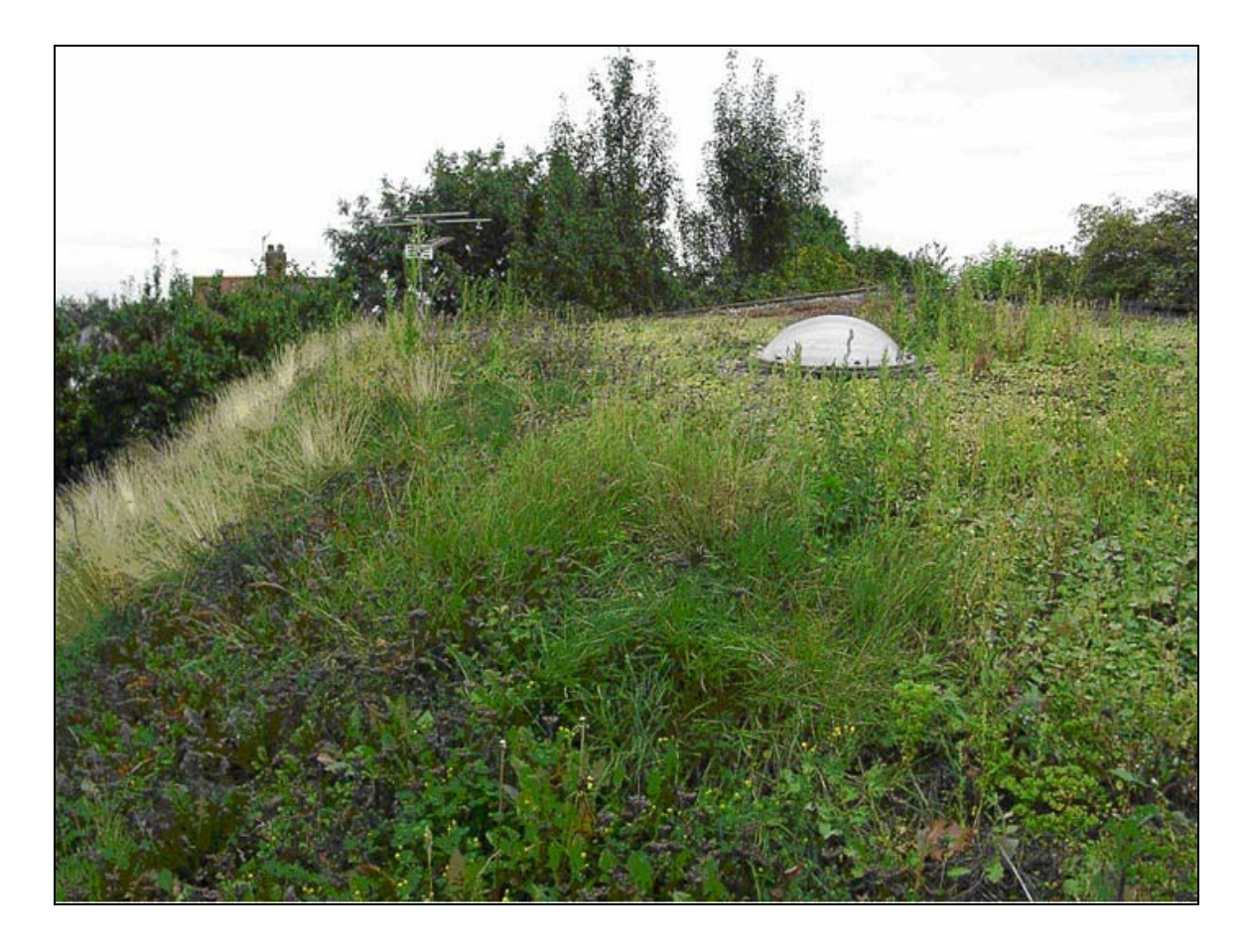
Figure 1: Part of the main roof at 11 Shaw's Cottages, south London.