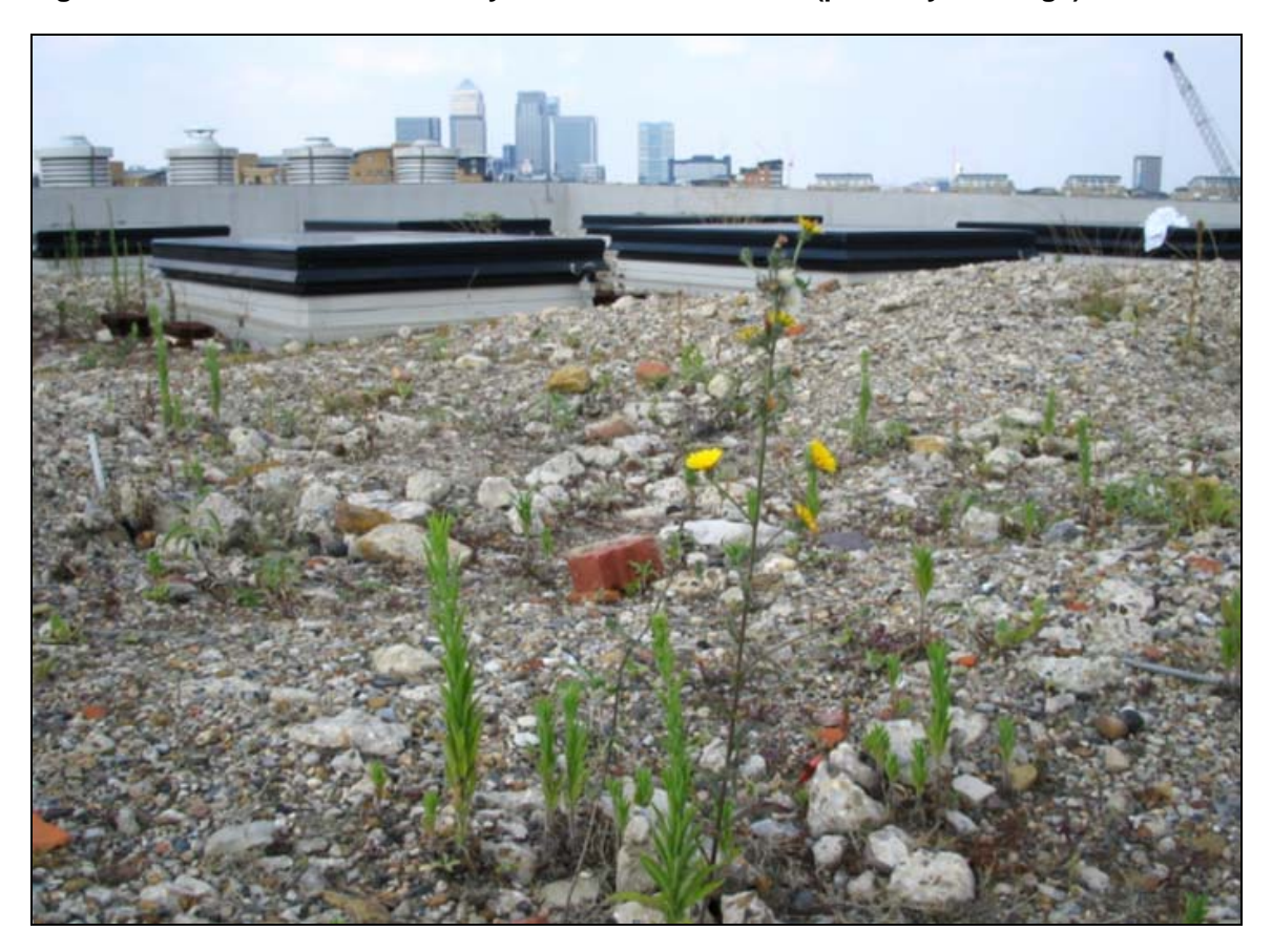
Figure 4. Black redstart roof three years after construction.