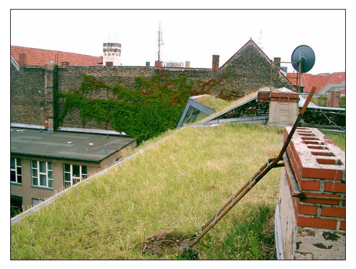
Figure 1a: The PLU research site in Berlin-Kreuzberg. In the foreground is flat sub-roof 9, which had the highest plant diversity of all the 10 sub-roofs in this project. The north-pitched sub-roof 10 is visible in the background; it had the lowest plant diversity.