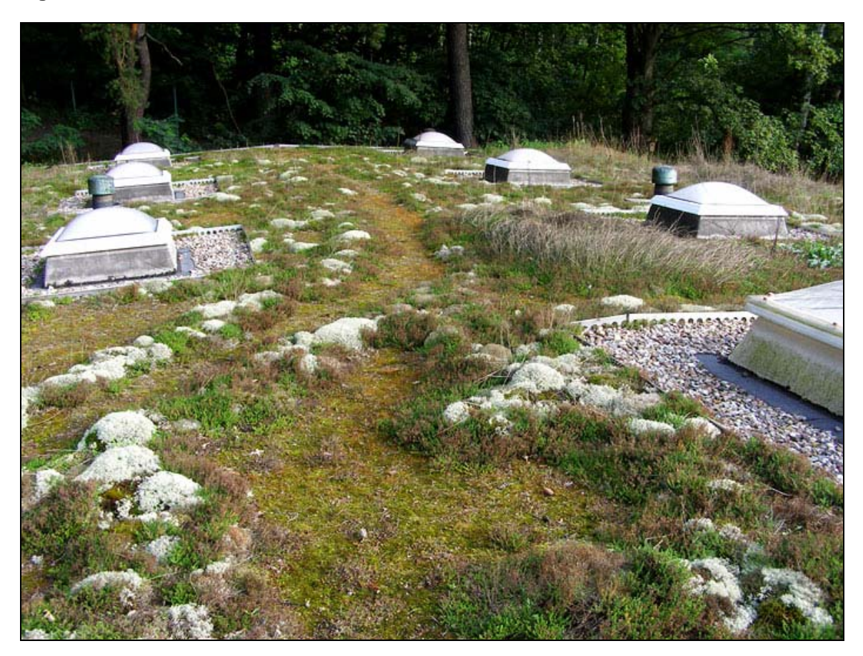
Figure 4: Green roof at Teufelssee, Berlin-Grunewald.