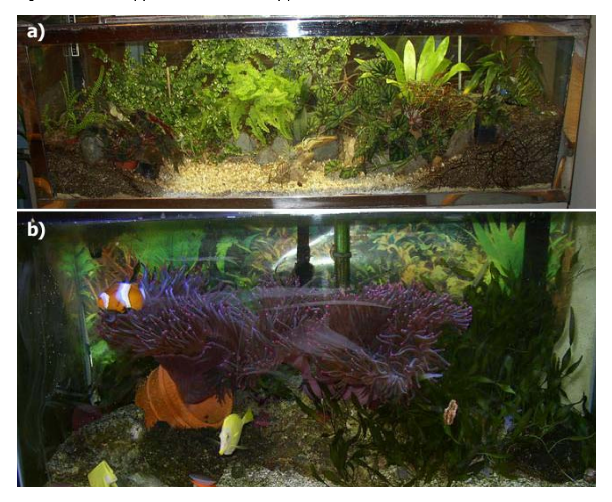
Figure 3. Terrestrial (a) and marine coral reef (b) mesocosms