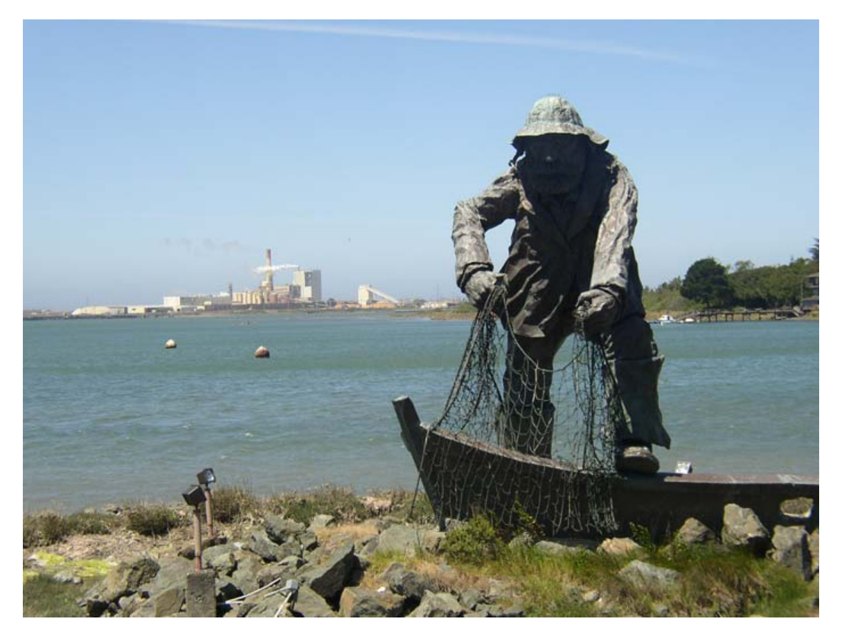
Figure 1. An estuary in Eureka, California