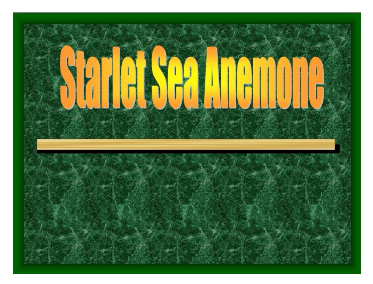
Figure 4. Sample of pilot presentation done using PowerPoint software (Odyssey High School, South Boston, MA, 2004)