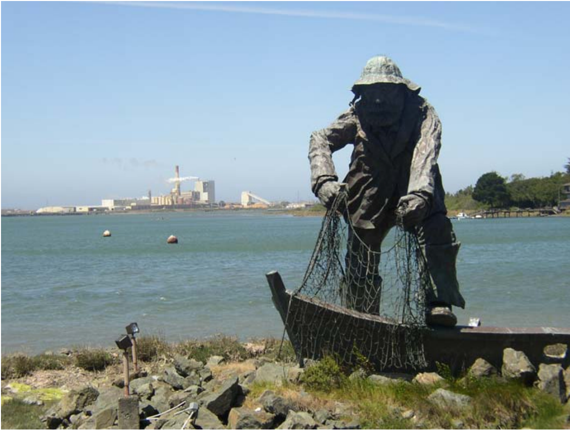
Figure 1. An estuary in Eureka, California